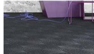
Black Art Vulcano Carpet - winner red dot award: product design 2010